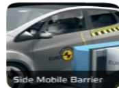
Side Mobile Barrier