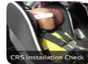
CRS Installation Check