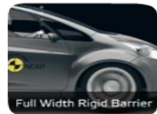
Full Width Rigid Barrier