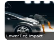
Lower Leg Impact