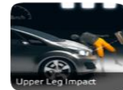
Upper Leg Impact